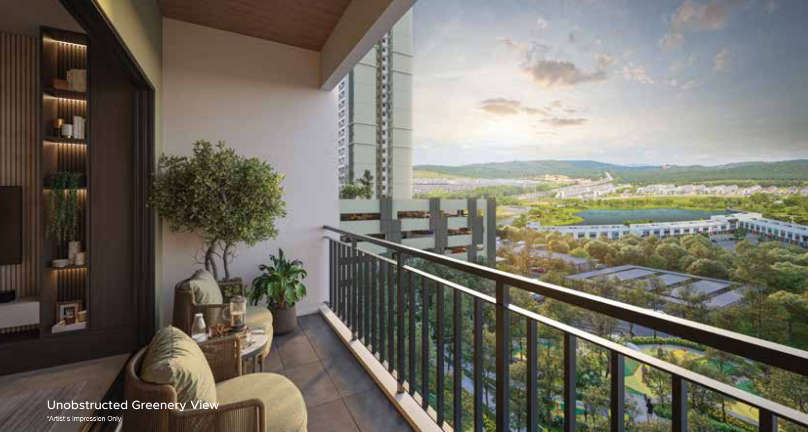
Unobstructed Greenery View *Artist's Impression Only